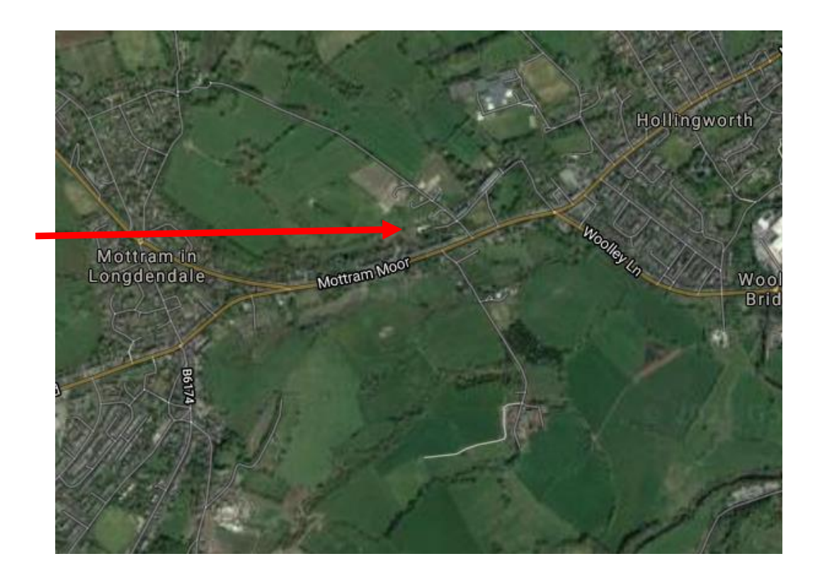
Photo 1: Aerial view:- Location relative to Mottram and Hollingworth

Erection of an agricultural building, tractor store, feed silos and associated works for the purposes of rearing cattle (part retrospective application)